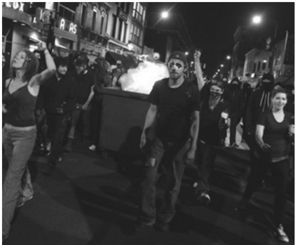
G-20 protesters light up the night in Pittsburgh demonstration against the globalized bailout of capital on the backs of poor and oppressed people.